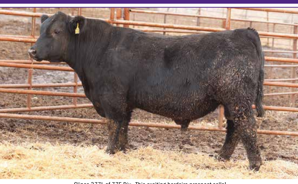
Clines 377L of 77E Div. This exciting herdsire prospect sells!