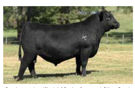
Partisover Justified 146, the featured Cline Cattle sire of herdsires, is the sire of Lots 30 and L38.

Elite Herdsire Prospect! This is a near exact-replica of his sire, Partisover Justified 146. He's a potential heifer bull with tons of performance along with being outstanding in his phenotype, great structured and footed, big scrotaled, and a ribeye improver. He's backed by phenomenal cows on both his maternal and paternal sides of his pedigree. His Vixon cow family have been some of my very favorite cows 3 generations in a row. His paternal grandam, Partisover Burgess 133, is a nationally known cow with a reputation for producing extremely productive, beautiful, easy fleshing cows that have made a name for themselves. We have heavily invested in the Partisover Burgess 133 cow family the last year by purchasing 2 of her finest daughters and one of their sons.