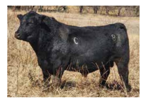
Clines Unanimous 87, the sire of 357L, 375L, and 373L.

If you want a bull to add thickness, width, muscle, fleshing-ability and the ability to make great cows this is your bull. A real powerhouse herdsire prospect here.