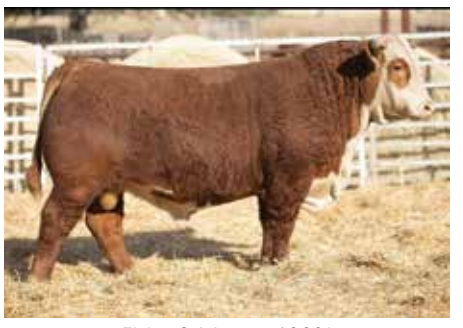
Flying S Advance 1060J