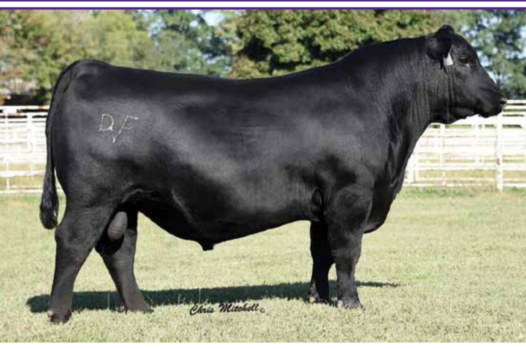
Deer Valley Optimum sire of 362