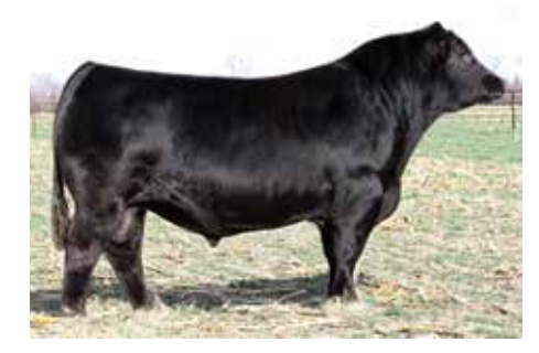
CLRS Dividend, the featured Select Sires Simmental All around sire and sire of 377L.

Exciting SimAngus Herdsire Prospect! An extremely stylish, correct, smooth made son of Dividend by 77E, a cow that brings in one of the very best every year. A bull I feel has a lot of potential to raise a group of feature heifers every time and steers that make the buyers excited.