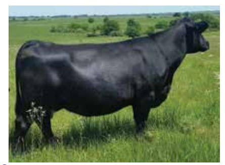
Clines Everelda Entense 27, dam of Clines 87, the sire of 357L, 375L, and 373L

Another Clines 87 son that is a 1/2 brother to 357L that has plenty of muscle and dimension. He's an attractive bull that will hold up for many years.