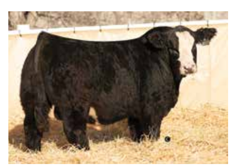
Wheatland Bull 388L