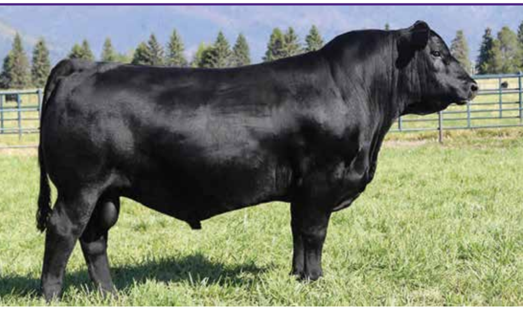
Montana Outcross, the featured Cline Cattle herdisre and maternal grandsire of L356