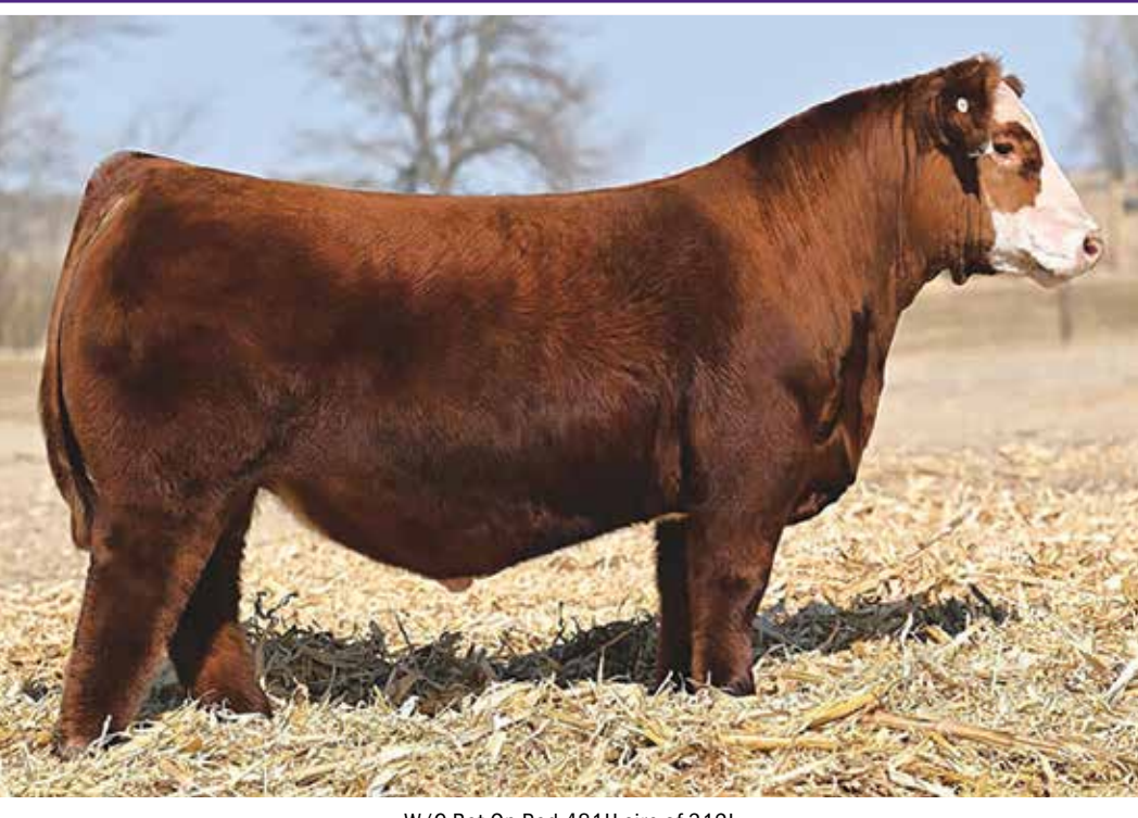
W/C Bet On Red 481H sire of 312L