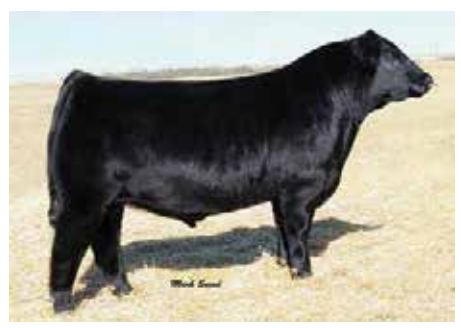
Nevermore 8138, Maternal Grandsire of 383

What a big powerful herdsire prospect. His dad must've jumped and ran as we can't identify his sire at the moment so he sells as a commercial. His dam 833, is a daughter of Nevermore out of the Finks Vixon cow family. You'll want to take home this outstanding bull sale day.