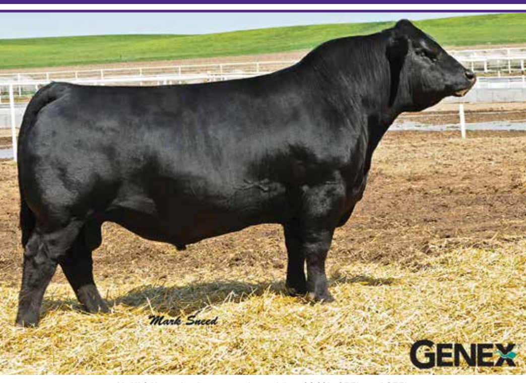
Mr NLC Upgrade, the maternal grandsire of 349L, 357L, and 375L.