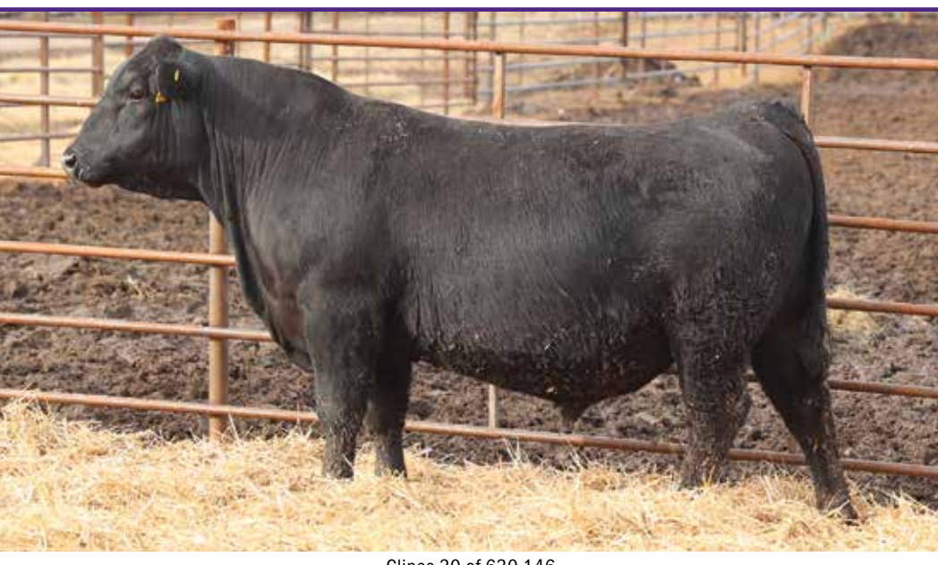
Clines 30 of 630 146