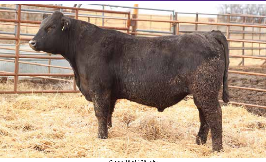
Clines 35 of 105 Jake