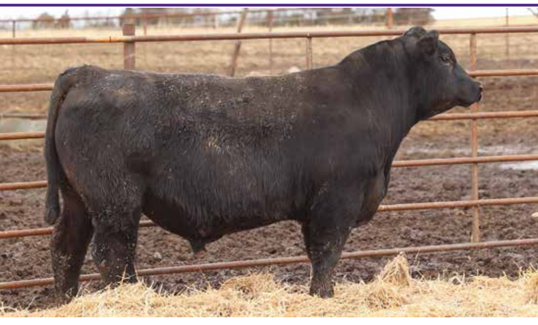
Clines 375L of 575 87