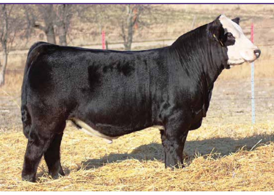
W/C Loaded Up, Maternal Grandsire of 873F