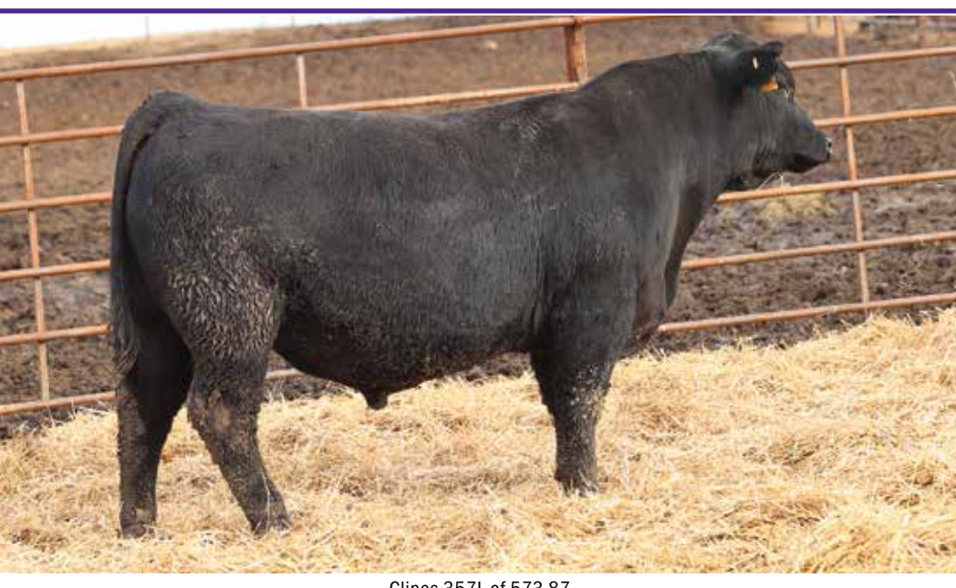
Clines 357L of 573 87