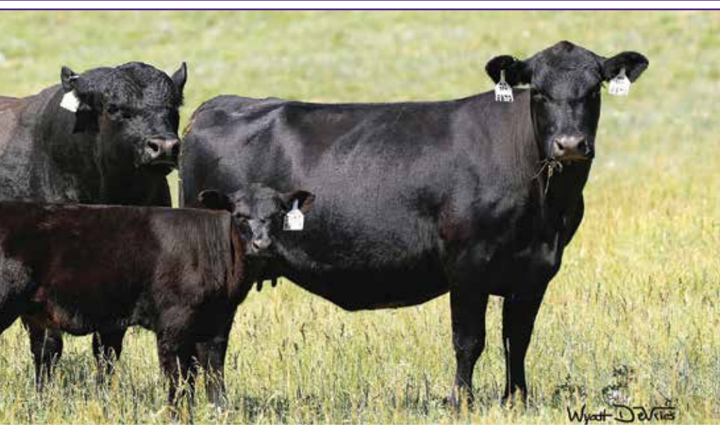
Sinclair Primrose 8BT3 7F4, the beautiful, highly-maternal dam of L38.