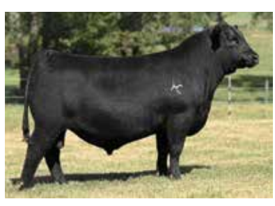
Partisover Justified 146, the highly regarded sire of 327L and 349L.

A feature heifer bull SimAngus prospect with plenty of frame, length and performance to be used on cows. His dam, 427B, raised many sons that are busy breeding cows across Kansas. A bull that's pretty hard to fault. One of the few chances to buy a SimAngus son of Partisover Justified 146.