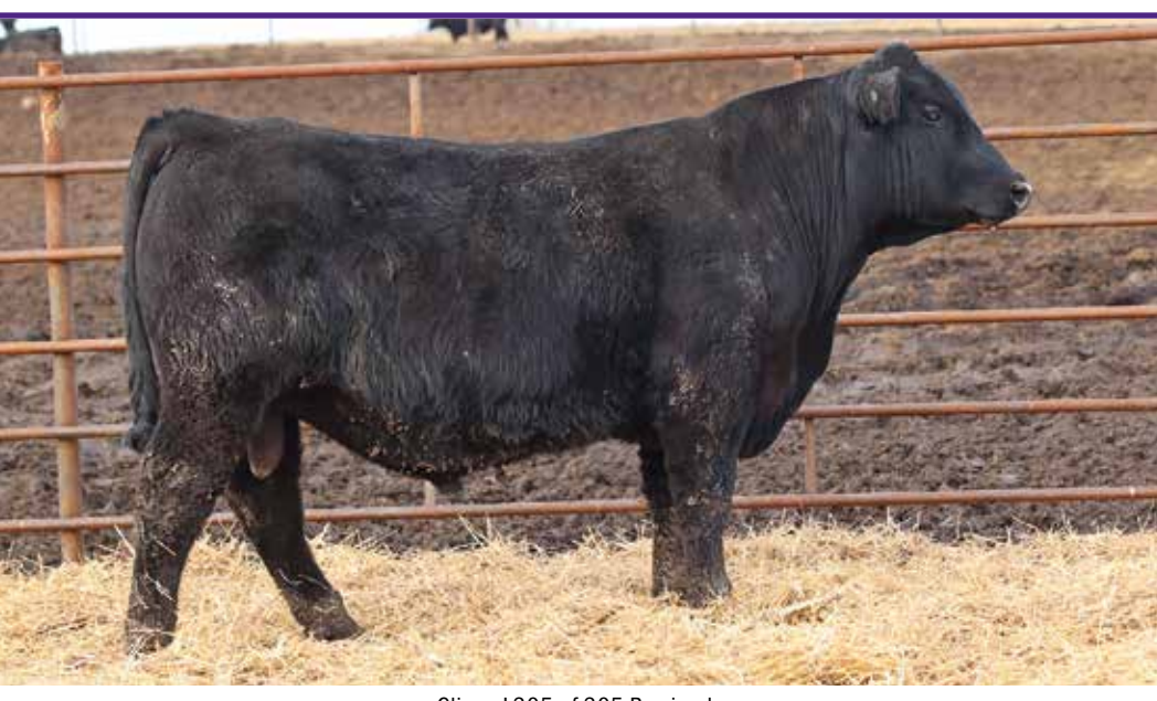
Clines L305 of 305 Barricade