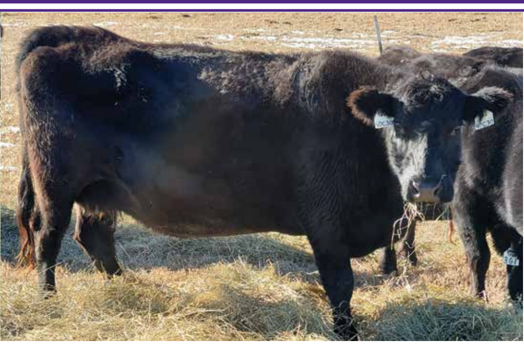
Sinclair Pride 90C30 2P9, the dam of L330.