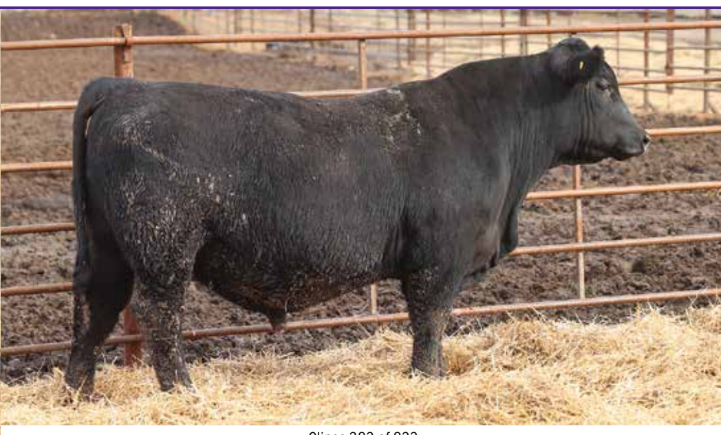
Clines 383 of 833