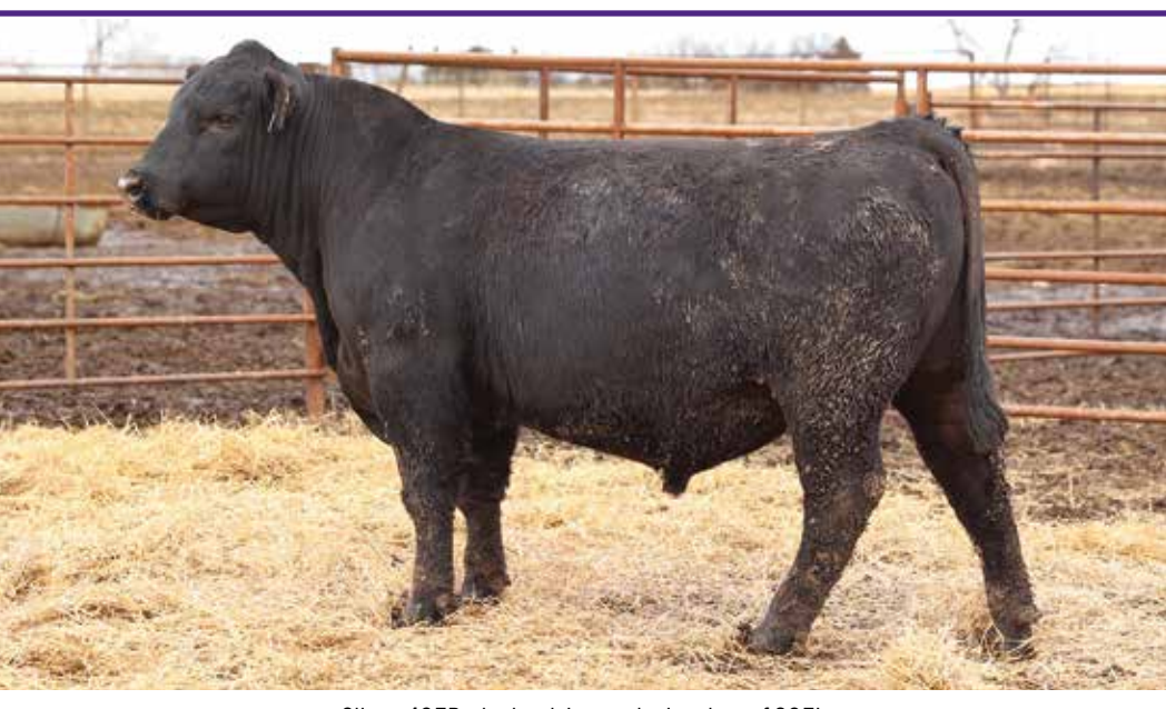
Clines 427B, the herdsire producing dam of 327L.