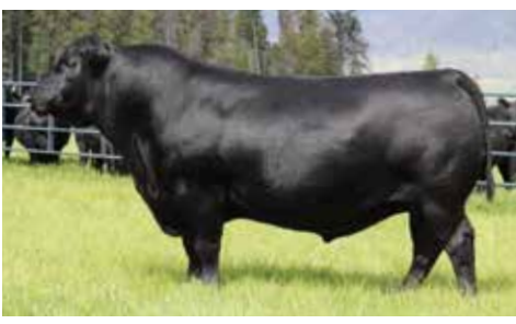
Montana Jake 1036, the calving-ease full brother to the $180,000 Montana Judgement, and sire of 35.

Top Herdsire Prospect! Potential Heifer Bull by our herdsire, Montana Jake 1036, which is the full brother to the $180,000 Montana Judgement 1038. 35 is a long necked, smooth shouldered, and long bodied bull with some added frame and eye appeal that will raise fantastic daughters and a set of big-ribeyed great feeding steers. He possesses a lot of goodness in convenience traits docility, hair shed, heifer preg, ribeye, feet, and more so be sure to check out his DNA scores. 35's dam is a daughter of the dam of lot L305.