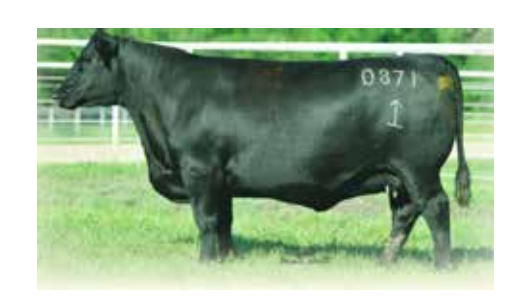
Sandpoint Lady Erica 0871, the foundation grandam of 287.

287 is a heavy muscled, sharp fronted, powerful individual that is easy to pick out. He has plenty of performance to wean the big, heavy steer calves for sure. His dam, 587, raised one of the best few every year and his grandam is still here nursing a calf at 14. Keep females by this guy, and you will really enjoy looking at them.