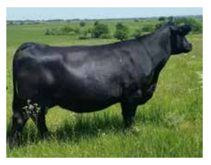
Clines Everelda Entense 27, the foundation grandam of 207.