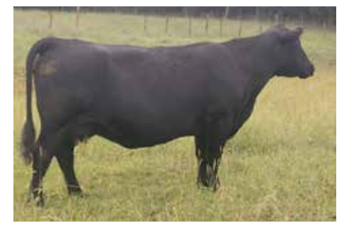
Clines Eline 305, a nearly ideal daughter of Barretts Iron Mike and the dam of 205.

205 is an intriguing prospect with a huge hip, lots of muscle, clean fronted, and is a sound structured, good footed cow-maker sire out of a tremendous 11 year old Barretts Iron Mike dam who does a great job every year. Buy this bull to keep foundation females from to move your herd forward in the problem-free direction. This was a very astute cattleman from out of the country's pick when he visited our operation this winter. Don't miss this near ideal cowmaker!