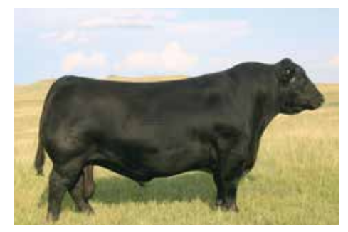
S A V Renown 3439 sire of Clines 677.

SC CEM MILK CW Marb REA $M $W ŚG ŠС 26 .33 .73