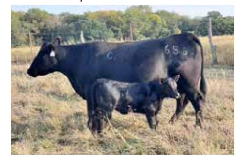
LLC Lucy 656, the dam of 256.

This massively-made, athletic striding bull will add pounds to your calf crop. He's backed by several generations of the breeds elite cows on top and bottom of his pedigree. An all-around prospect here.