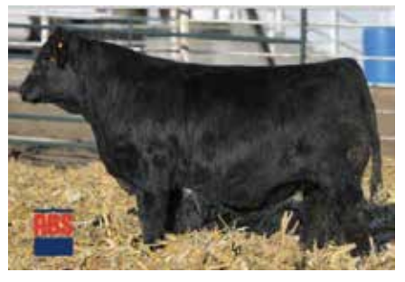
TJ Gold, the popular ABS Calving ease SimAngus sire and the sire of 282K.