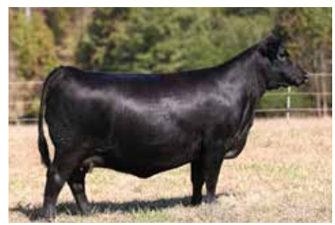
Partisover Burgess 209, the illustrious full sister to 146.