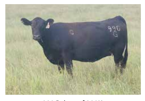
990G dam of 290K.

290K. A powerfully constructed, meaty topped, long bodied bull out of a top producer who we've kept several daughters in the herd by. A universal breed improver for either weaning big heavy steers or keeping them sweet replacements.