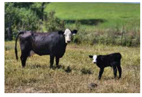
282K as a baby with his dam.

282K is our only baldy sire this year, however an extremely good calving ease prospect by the featured ABS Sire, TJ Gold, and a 4th generation SimAngus female here out of an excellent cow family. 282K is a universal sire that could be used on heifers or your best mature cows.