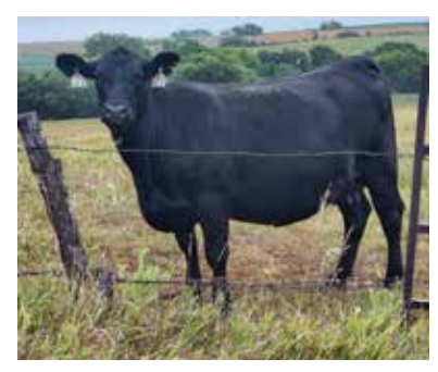
LLC Everelda Entense 07, the beautiful dam of 207.

A double-digit ce, low bw son of Justified 146 backed from generations of favorite dams in the Cline Program descending from the legendary, iconic Sitz Everelda Entense 1905. His Rainfall dam is phenotypic and nearly flawless in every way. She will be the Entense that paves the future in our program. 207 is the ultimate maternal and calving ease bull whose daughters will make you drool. Terms announced sale day.