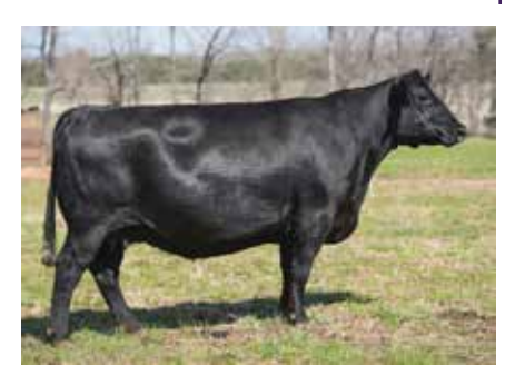
Partisover Burgess 6155, the foundation grandam of 249.

CED BW WW YW SC CEM MILK CW Marb REA SM SW SF $G $C 69 4.0 96 158 0.84 12 26 .50 .92 71 82 105 51 273