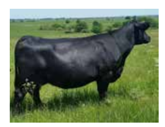
Clines Everelda Entense 27, the powerful foundation dam of Clines 87.

A stylish, strong topped, heavy muscled bull who's dam is a granddaughter of the dam of lot 205. These 2 bulls would be a good pair if you wish to increase consistency and quality in your females to stay in your operation into their teen years.