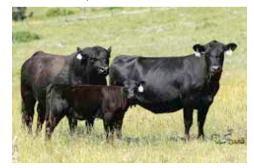
Sinclair Primrose 8BT3 7F4, the dam of 283.

A really powerful, correctly built "87" son out of a nearly immpecable Sinclair Cattle Co bred BT Right Time 24J cow from the same Primrose cow family as Sinclair Emulation XXP. We plan on building an entire cow family around 8BT3 in coming years. If you're serious about long-term beef cow production this is your bull!