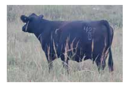
Clines 427B, the herdbull producer and dam of 227K.