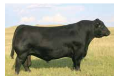
SAV Renown, the highly proven, highly popular performance sire of Clines 677, the sire of many of the bulls selling.

227K is a calving ease Sim Angus that is a half brother to many high seller SimAngus bulls in the past. His dam is one of our very best for raising a very top calf every year. She never misses. He will be sure to be a crowd favorite. His sons will top the sale and his daughters will headline the replacement pen.