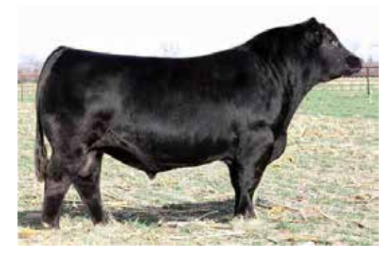
CLRS DIVIDEND 405D, sire of 225K