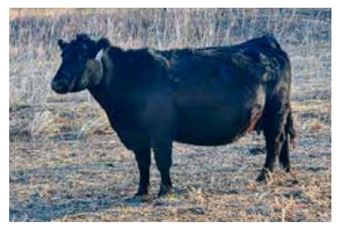
CLINES MISS 40, the dam of 20.