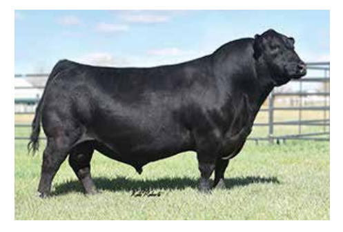
KG JUSTIFIED 3023, the highly proven and popular calving ease sire of 212.

CEDBWWWYWSCCEMMILKCWMarbREA$M$W$F$G$C7-0.4631030.82432390.650.3985747646243212 is a impressive individual by KG Justified that checks all the boxes. Out of a nice young cow and is heifer safe.