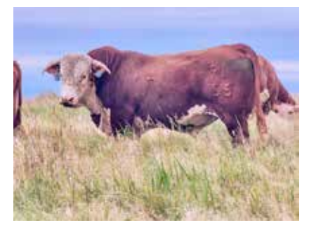
CL1 DOMINO 9155G, the outstanding sire of the Hereford lots.