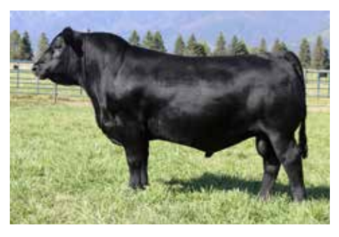
MONTANA OUTCROSS 9077, the outstanding sire of 20.

I'll keep it simple. Replacement females will be really special out of "20". You'll be seeing a bunch more Outcross sons in our 2024 spring sale. We are excited about what Outcross is doing in our program. 20's dam, is one of our very favorite cows. We believe you will be pleased.